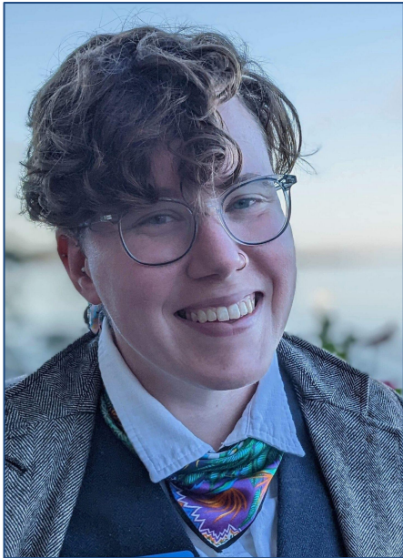
Katie Castagno Center for Coastal Studies